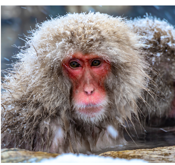
Snow Monkey, Yudanaka